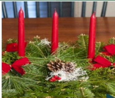
Classic Centerpiece - $40