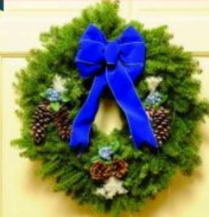
Blueberry Wreath - $38