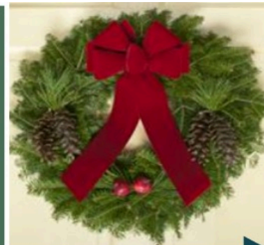
Coastal Pine Wreath - $36

ORDER BY NOVEMBER 12, 2018: squareup.com/store/kennebunk-free-library