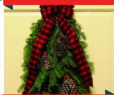
Hamilton Plaid Spray - $38