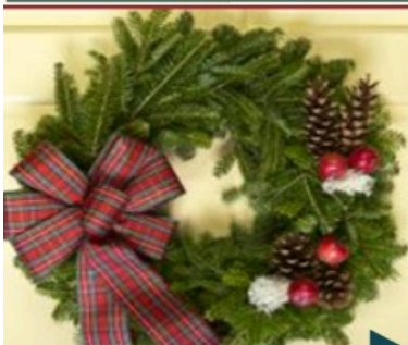
Traditional Wreath - $40