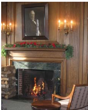
Reading Room Circle