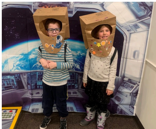
A couple of intrepid space explorers at our Sci-Fi Celebration