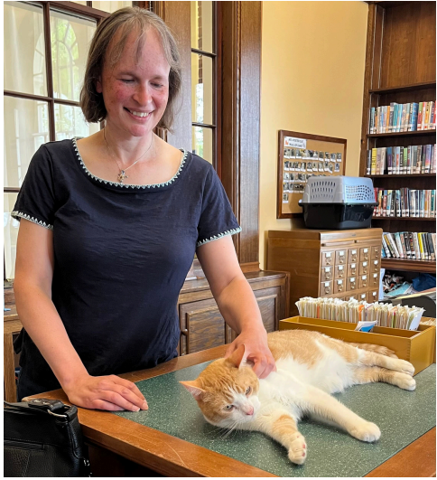
With Milo's adoption in July, we celebrated our 50 th foster cat adoption through our partnership with the Animal Welfare Society!

Here are a few of the ways we are carrying out our mission to inspire and enable our communities to discover, learn & connect.