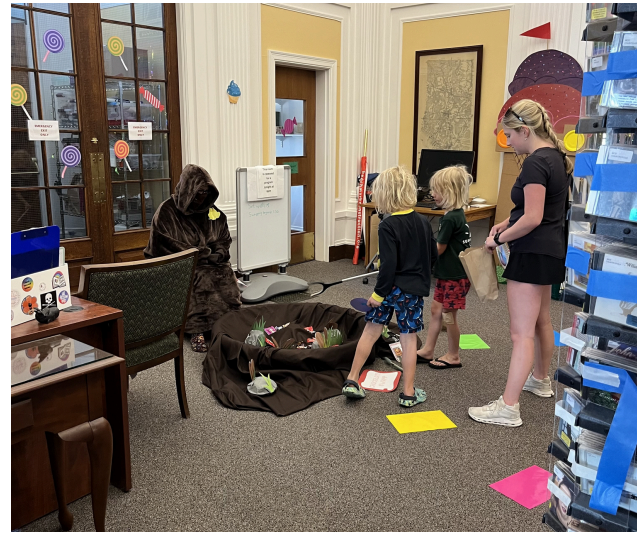
Candy Land players making their way through the Chocolate Swamp

Here are a few of the ways we are carrying out our mission to inspire and enable our communities to discover, learn & connect.