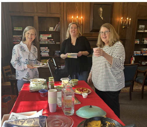
Each month, our Cook & Share Cookbook Club meets to celebrate food through various dishes and themes