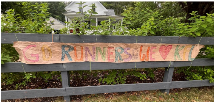
We love all the community support along our 5K route!