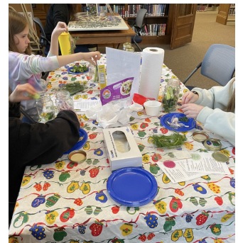
Teens learned all about the science behind fermentation and pickling, getting to take home their own batch of pickles!