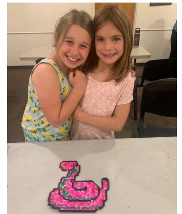
Two friends showing off their creation at Beadcraft!