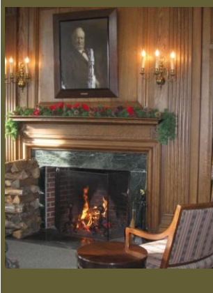
Reading Room Circle

For more information about this free program, please email or call the Library at 985-2173. No reservations are needed.